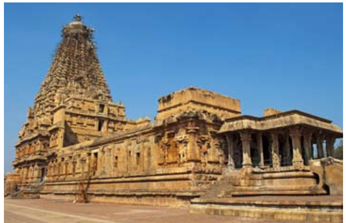
Brihadeeswarar Hindu Temple in Thanjavur. Tamil Nadu, India

“There is going to be a steep growth of Indian students looking for international education opportunities abroad in the years to come,” says Mallik. With 32.3% of total population under the age of 14 and approximately 250 million people in the age range of 15–30 (approximately 25% of the total population), India will be an ideal market to build or establish your international recruitment structure. A noteworthy disparity exists between India's public and private schools.