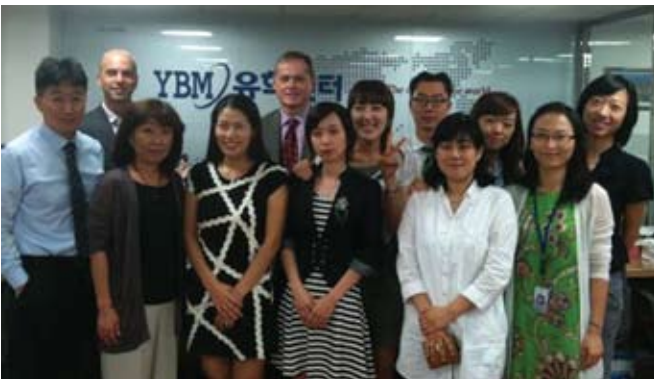
YBM Overseas Education Services counselors at the first pilot assessment on August 23, 2011, with ELS colleagues

ELS announces the Counselor Certification program, a comprehensive approach to ensuring that students in their home country find the best possible program and institution to match their needs, desires, preferences, and qualifications. This approach emphasizes counselors' thorough ability to use the available ELS reference tools—about specific higher education institutions and programs—first in a training mode and then in a final Assessment that can confer the “certified” status.